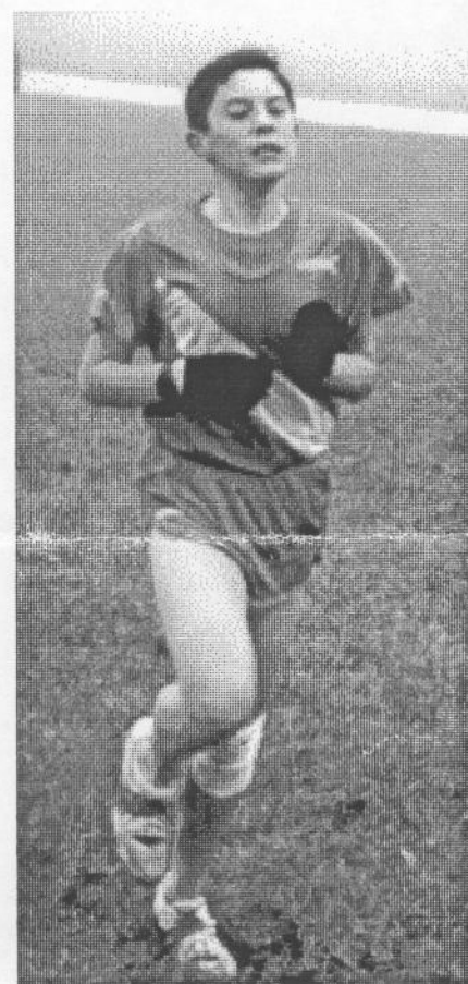
A Cook, in 2nd place, heads the Oxford challenge for the runners up overall placings.